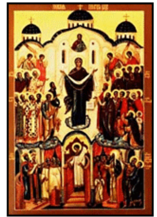
Protection of the Virgin Mary

July 4 2010 6th Sunday after Pentecost/Tone 5 St Andrew, Archbishop of Crete, Venerable Martha