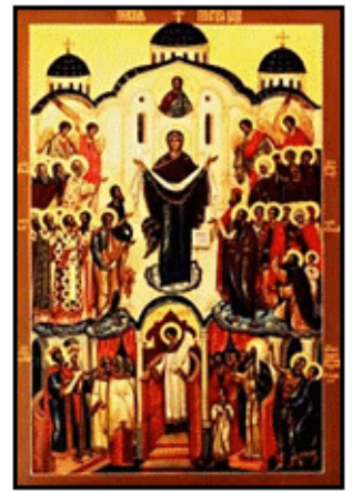
Protection of the Virgin Mary

8600 Grand Blvd. Merrillville, IN 46410 (219) 947-4748 (Church) (219) 730-4698 (Hall Rental)