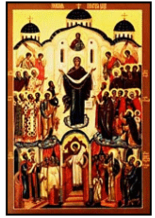
Protection of the Virgin Mary

2nd Sunday of Great Lent St Gregory Palamas